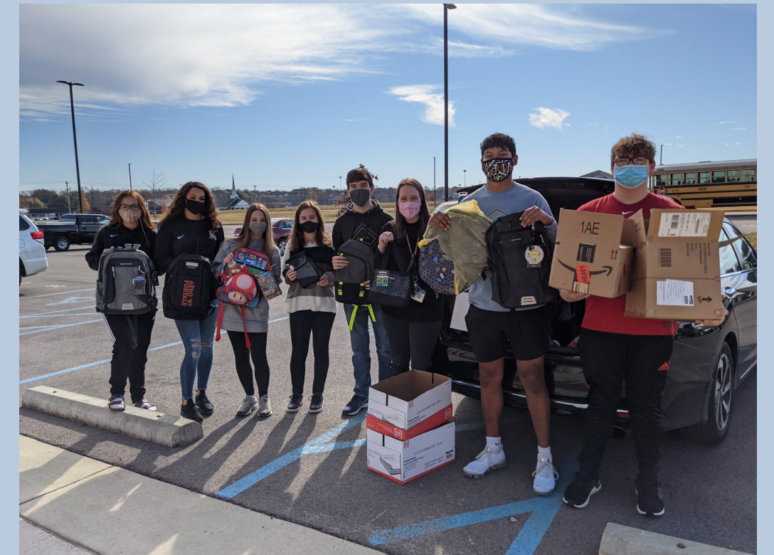
ATHENS HIGH SCHOOL