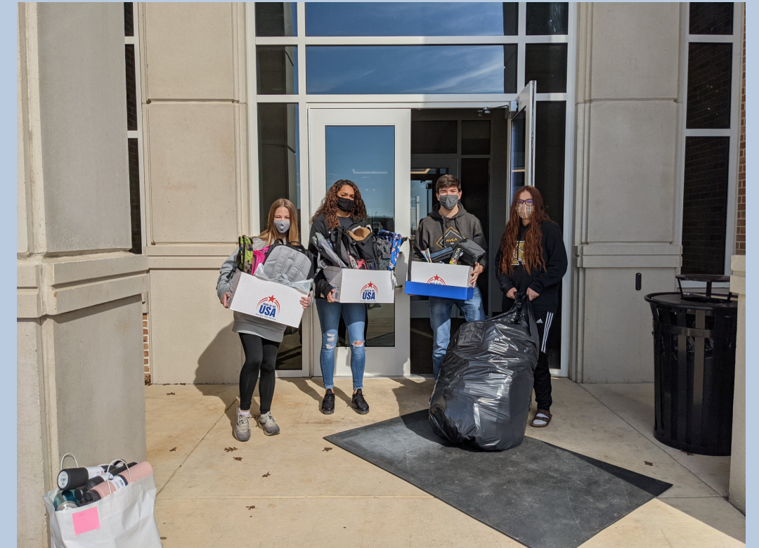
ATHENS HIGH SCHOOL