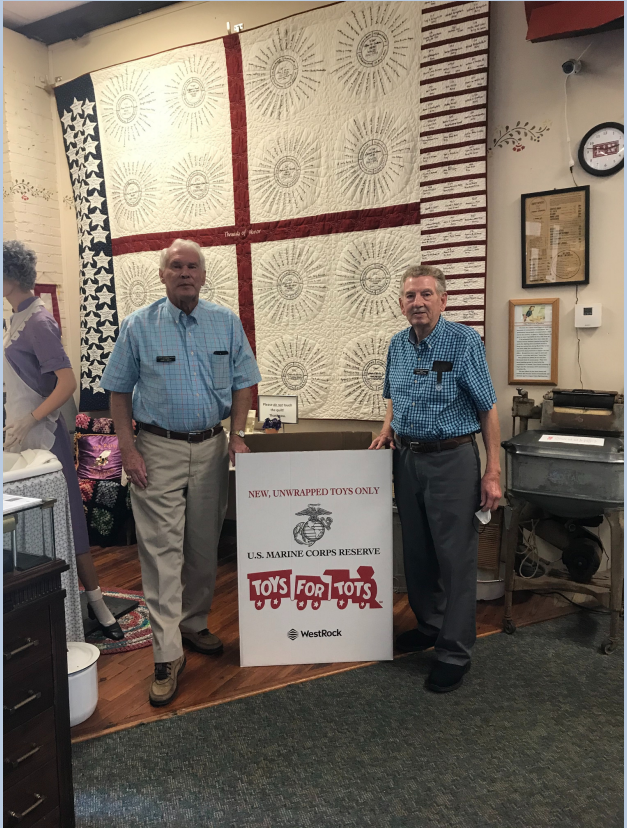
ALABAMA VETERAN'S MUSEUM